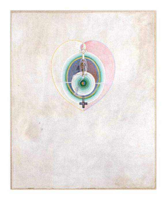
The Dove No 11 October 2024?