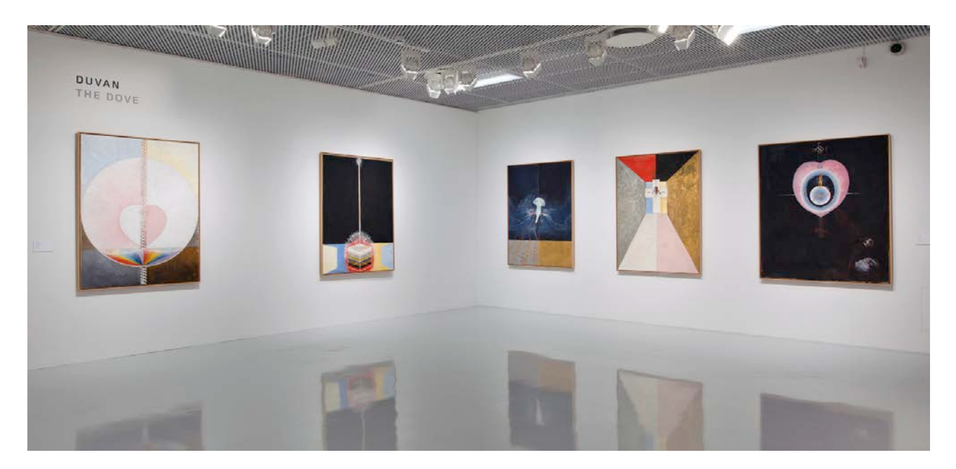
The Museum of Modern Art, Malmö, 2020

compensation to the Foundation), the book Esoteric Sweden (<u>contract</u><sup>12c</sup> written two months after <u>publication</u><sup>12d</sup>), agreements between the CEO and board member and <u>vice versa</u><sup>12e-g</sup> (none with individual signing rights), the CEO grants a board member ' exclusive rights to freely and without restrictions access ' the Founder's notes and <u>'the right to freely quote from these documents</u>'<sup>12h, page 1</sup> a few weeks before this board member is stepping down, the CEO grants certain board members ' the right to freely and without restrictions access works and documents ' in the Foundation's archive and <u>'the right to freely quote</u>'<sup>12h, page 2-4</sup> from Hilma's notes. Stolpe Publishing also has published a large amount of material featuring Hilma's art without any agreements with the Foundation. The CEO, who was responsible for the Foundation's website, gave the impression that everything was in order. The CEO importantly withheld information from the chairman, protected by the board majority.